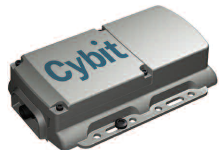
AssetLocator trailer tracking unit